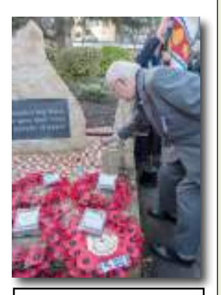
Laying a wreath at the new memorial last year

This will include the laying of wreaths at the memorial stone.