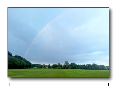
A rainbow over this autumn turned Westwood Park into a green jewel and added extra colour

Chessfield Park entrance was investigated during the summer and blocked drainage pipe was located and cleared. We will continue to monitor to see if this has resolved the flooding problem.