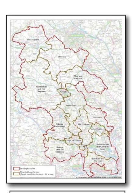
Map showing the preferred Buckinghamshire Council option of 14 community boards

It is proposed that county councillors from the local area would sit on their local board. To