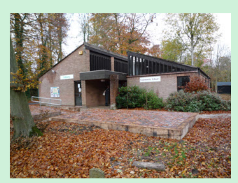
The library frontage is currently being landscaped

interest as a model for other communities. The library, which has just celebrated its 4th year in operation, offers all the facilities of a Council-run library and more. You can use your Council library card to borrow books and other items from their stock which is regularly updated. You can also take advantage of the free public access PCs and Wireless Broadband. Take the opportunity to visit this great facility. You will not regret it.