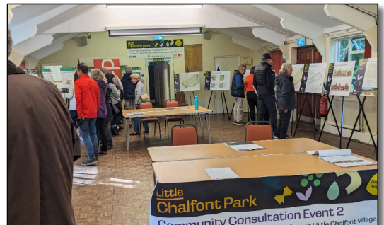
Some early arrivals at the September consultation on the development of the old golf course, by the Hill Group

As is normal for major development projects like this, construction work will not commence until the required third-party approvals have been received, which makes it difficult