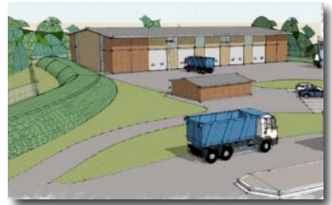
A stylised version of what the proposed new Waste Disposal site will look like

Although the closing date for public consultation has now passed, no date