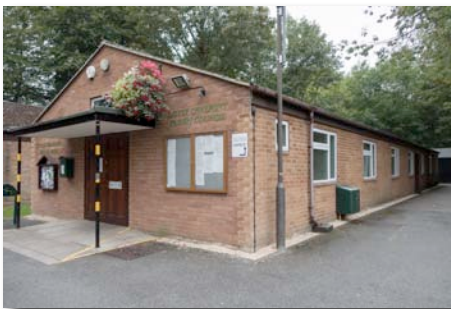
Our current village hall, built 1952, is no longer fit for purpose

The current Parish Council offices, located out of sight at the rear of the village hall, are cramped and poorly sited. Its current location makes it difficult for local residents to visit the council offices should they wish to raise a local matter in person.