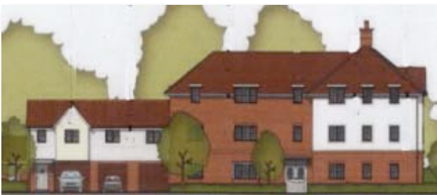
An illustration of part of the proposed new development for the Donkey Field in Little Chalfont village.

Once adopted the new local plan will cancel the Core Strategy and DDPD and this local plan will be the only CDC plan within the development plan. ■