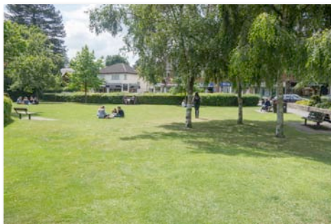
Little Chalfont village green, after the grass was cut this summer.

Negotiations are underway and on 10 September 2014 Little Chalfont Parish Council voted in favour of taking over the work, subject, of