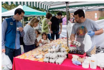
Plenty of fresh produce on sale at the local farmers' market (pictured above)