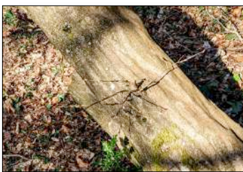
New shoots from ancient hornbeam (left). Sheltering in a tepee (right)

We are pleased to report that our wonderful ancient hornbeam, which was partially uprooted in storms during the past winter, is showing signs of recovery. The tree was