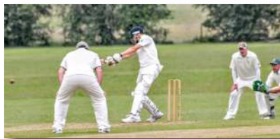
Howzat!! The Chorleywood Cricket Club in action

There are lots of ways to join in – not only playing but umpiring and scoring too, so if you have ever thought of participating, or your daughter or son has and would like to join in, there is a game or role for everyone and you