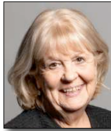
Rt Hon Dame Cheryl Gillan, MP 21 April 1952 – 4 April 2021

Her work for this community over 29 years has been of huge benefit to residents of all political views. Her campaigning against HS2 was instrumental in