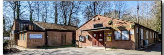
The village hall and community library as they are today

The greatly-valued community library is also getting old, is increasingly expensive to run, and has run out of space to provide all