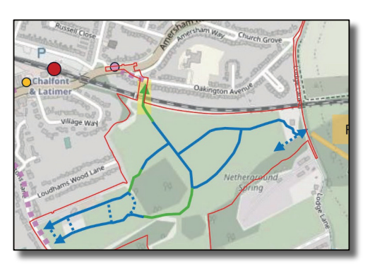
Illustration of siting of combined footpath and cycle footbridge from Little Chalfont Park to Oakington Avenue in yellow, centre

There will be opportunities for you to put questions to speakers and councillors at the meeting. Alternatively, you may submit your questions in writing before the meeting via email to clerk@littlechalfont-pc.gov.uk or post them in the letterbox next to the front door of the village hall. Please include your name and address. If you do not want your name and address made public, please state this clearly.